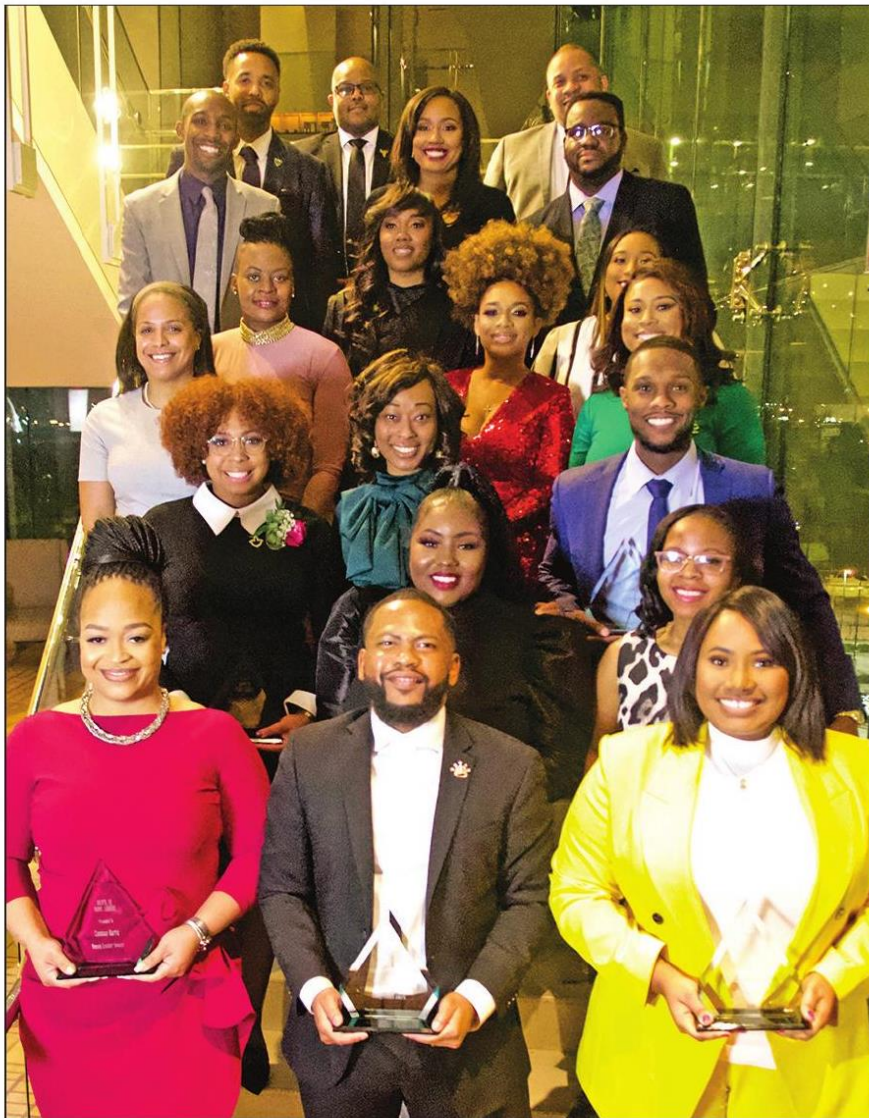
The 2020 Class of Young Leaders just after receiving their awards at the Four Seasons Hotel St. Louis.

Last week, nearly 300 attended the St. Louis American Foundation's 10th annual Salute to Young Leaders Networking Awards Reception at the Four Seasons Hotel St. Louis. Twenty outstanding African-American professionals, under age 40, were honored at the special recognition event. St. Louis-based #MLS4THELOU served as the Champion Sponsor of the event and Partner sponsors were Edward Jones, the Regional Business Council, the Urban League of Metropolitan St. Louis and Webster University. It was an evening of celebration that was energized by an appreciative audience that was inspired by the accomplishments and service of these honorees.